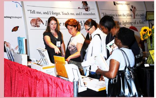
Exhibit Hall—Grand Ballroom B, 3rd Floor NAEYC Shop—Golden Gate 1, Lobby Level

NAEYC's Exhibit Hall and NAEYC Shop will be at the Hilton San Francisco Union Square. Check out the latest books, training materials, and other professional development resources over three days (see page 4 for days and times).