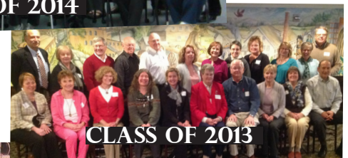
CLASS OF 2013