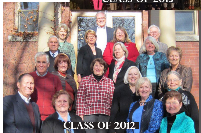
CLASS OF 2012