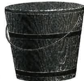
"Made in Keene."