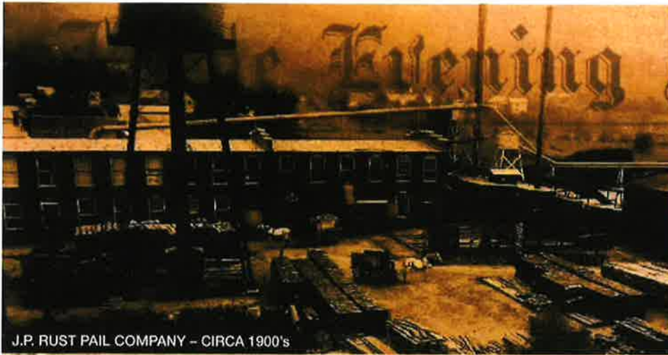
J.P. RUST PAIL COMPANY – CIRCA 1900's